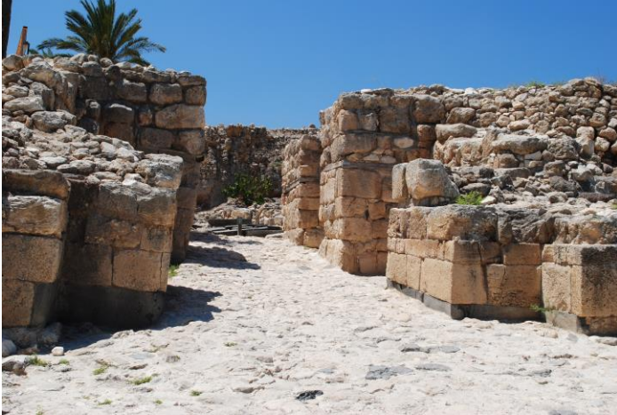
Gates into city of Megiddo

4. It would appear that Megiddo became an Israelite city during the wars of David when he wrenched it from the Canaanites and the Philistines. Solomon fortified the city during his empire and built a gate that can still be seen today (1 Kings 9:15).